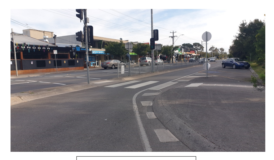
Shopping Strip (eight food outlets)