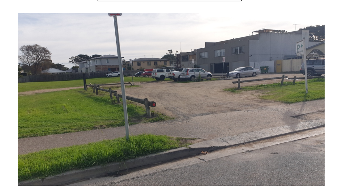
Rear Parking (capacity for 200+ cars)